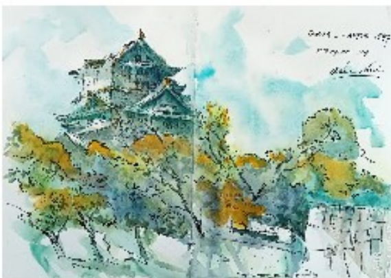
Example of a recent rendition from Alan but not of the subject matter for the workshop

Participants will use their own images which must include rocks of some sort, whether a beach scene or in a landscape.