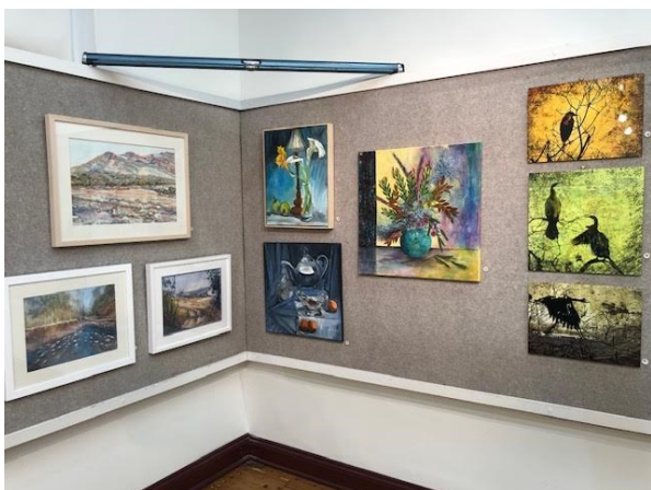
Small part of the Spring Exhibition