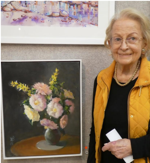
Happy customer with Don Burrow's oil painting