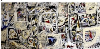
Life is Complicated

Home About Gallery Commissions Blog Contact Q f @ in