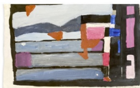
Sea to Mountain, Turkey