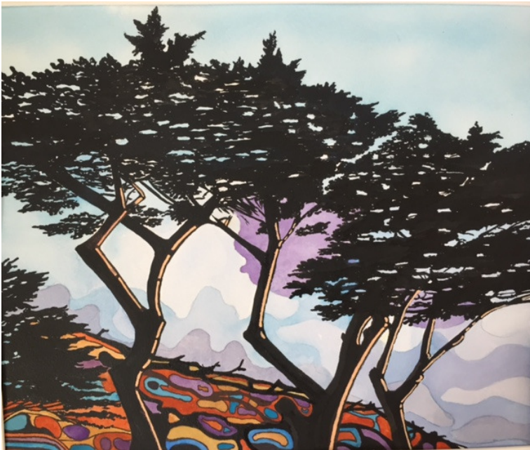
Coastal Trees by Marg Lynch