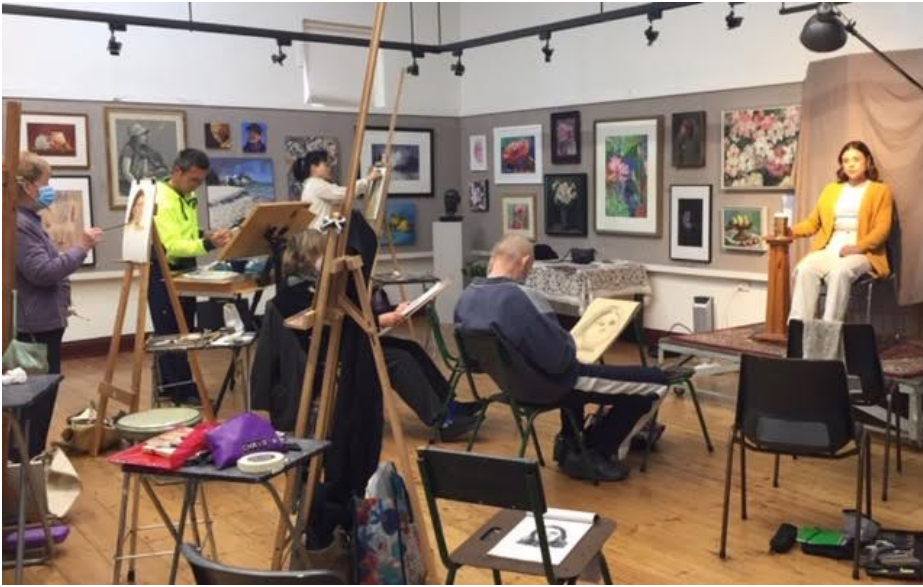
Members of the Thursday Portraiture Group hard at work