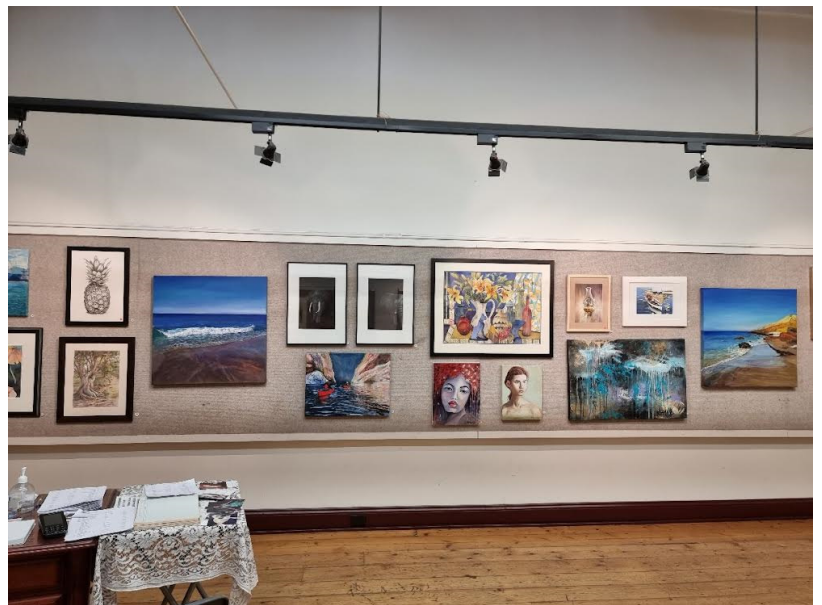
Paintings at the Exhibition