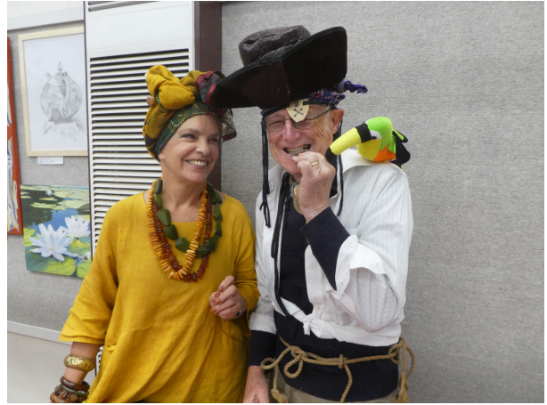
Pirate shenanigans at Christmas lunch!