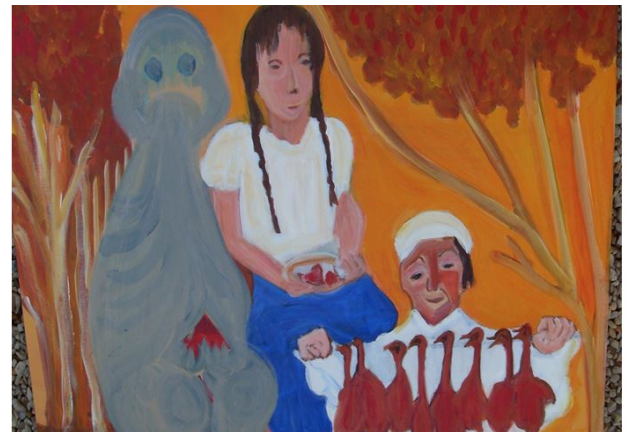
Mei Shackleton's painting (PTO to exhibitions)