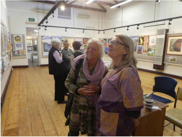
Looking for bargains at our one-day-sale!