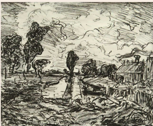
"After Constable." 08/22, lithograph, 130x160 mm

Kitchen lithography is so named because the equipment and chemicals can be found in most kitchens. The drawing is made on the dull side of aluminium foil, and usually treated with cola drink. The cola contains phosphoric acid and gum arabic, both of which are also used in conventional aluminium plate lithography. Printing can be done by hand or using an etching press, the former having the advantage of giving more tonal control. The method is best suited to simple artworks not requiring a wide range of tones, nor fine details. The lack of tonal range is its main disadvantage compared to stone or aluminium plate lithography. But it is nevertheless an accessible and effective print-making method that allows a more painterly approach than relief or intaglio printing. This example (my sketch after a small painting by Constable) shows its use in a linear style. I was experimenting, and the drawing was done quickly in a free, scribbly way. Those who know the painting will realise that the print is in mirror image.