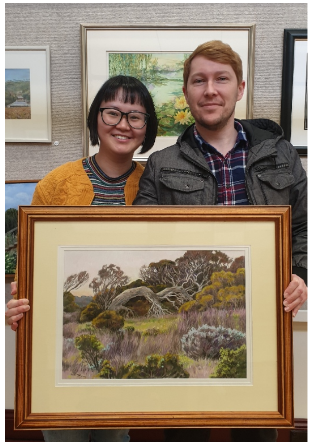
Two more happy customers