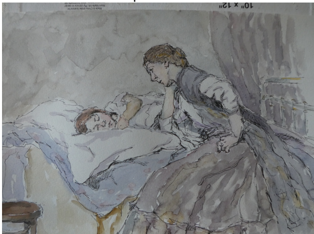
Chris's drawing of "Motherhood"

After our art efforts, with a café booking we have enjoyed chatting about art and life over lunch. We have thoroughly enjoyed our art outings and I would recommend this art option to others.